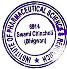
PRINCIPAL Institute of Pharmaceutical Science & Research (For Girls) Swami-Chincholi, (Bhigwan) Tal. Daund, Dist. Pune-413130