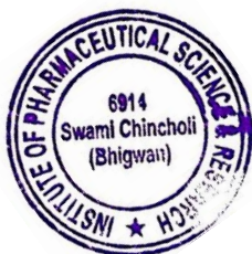
PRINCIPAL Institute of Pharmaceutical Science & Research (For Girls) Swami-Chincholi, (Bhigwan) Tal.Daund, Dist.Pune-413130